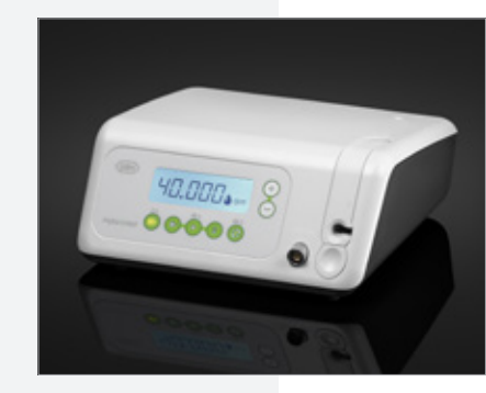
Easy to use

In combination the short motor and the ergonomically shaped contra-angle handpiece are perfectly balanced. You can work for long periods without fatigue or cramp in your hand.